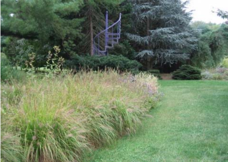
Grass border in the Maryland garden of Kurt Bluemel